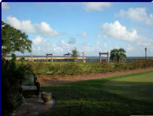
Grand Hotel in Point Clear, AL

The program officially kicked off on Sunday evening with an opening reception held on the Julip Point Pier.