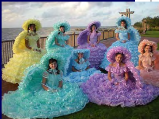
Azalea Trail Maids